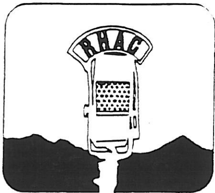
Radio Historical Association of Colorado